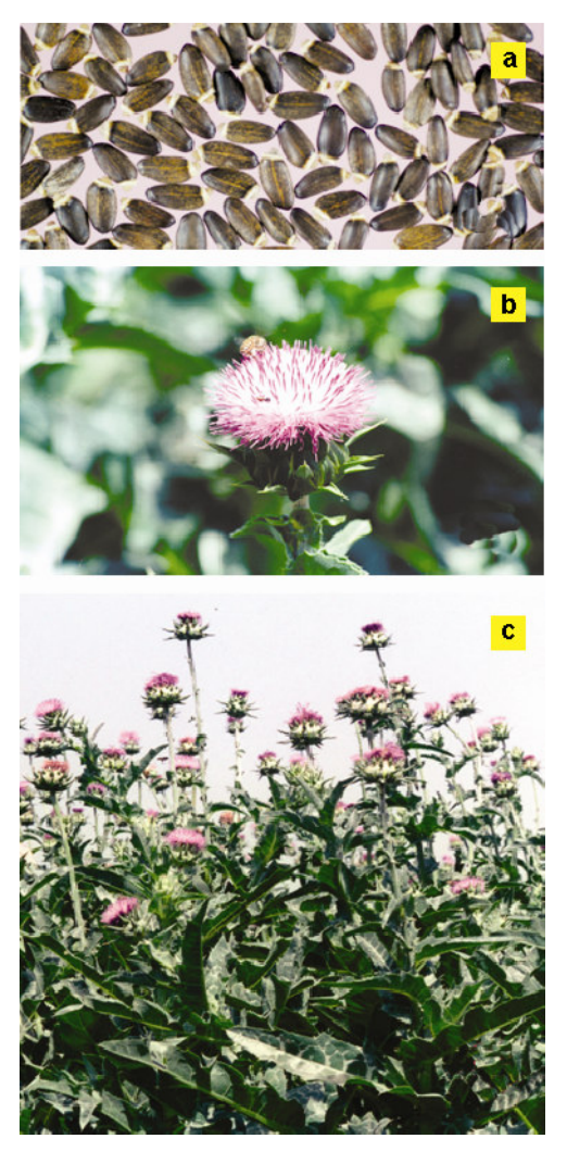
Plate 1—a) Seeds of milk thistle (black coloured achenes), (b) An inflorescence (Capitulam), (c) A view of the field grown crop

Seeds were separated from chaff, crushed and subjected to oil extraction in petroleum ether, using soxhlet apparatus, as described by Bajpai et al, 1999<sup>(Ref. 9)</sup>. The fatty acid methyl esters were prepared using the procedure of BIS<sup>30</sup>. Their presence was quantified using gas chromatograph (GC) Hewlett Packard, 6890 equipped with a flame ionization detector fitted with DB 225, 30m \times 0.25 mm ID, 0.25um film capillary column. The GC was programmed at temperature of 90 °C (5 min) to 130 °C at 3 °C/min and 130 °C (12 min) to 230 °C at 2 °C/min, split 50;1, injector vol 2µL and nitrogen as carrier gas was used with flow rate 30 mL/min. The injector and detector temperatures were 230 and 260 °C, respectively. The physical and chemical tests of the fatty oil were carried out using standard procedures of BIS<sup>31</sup>.